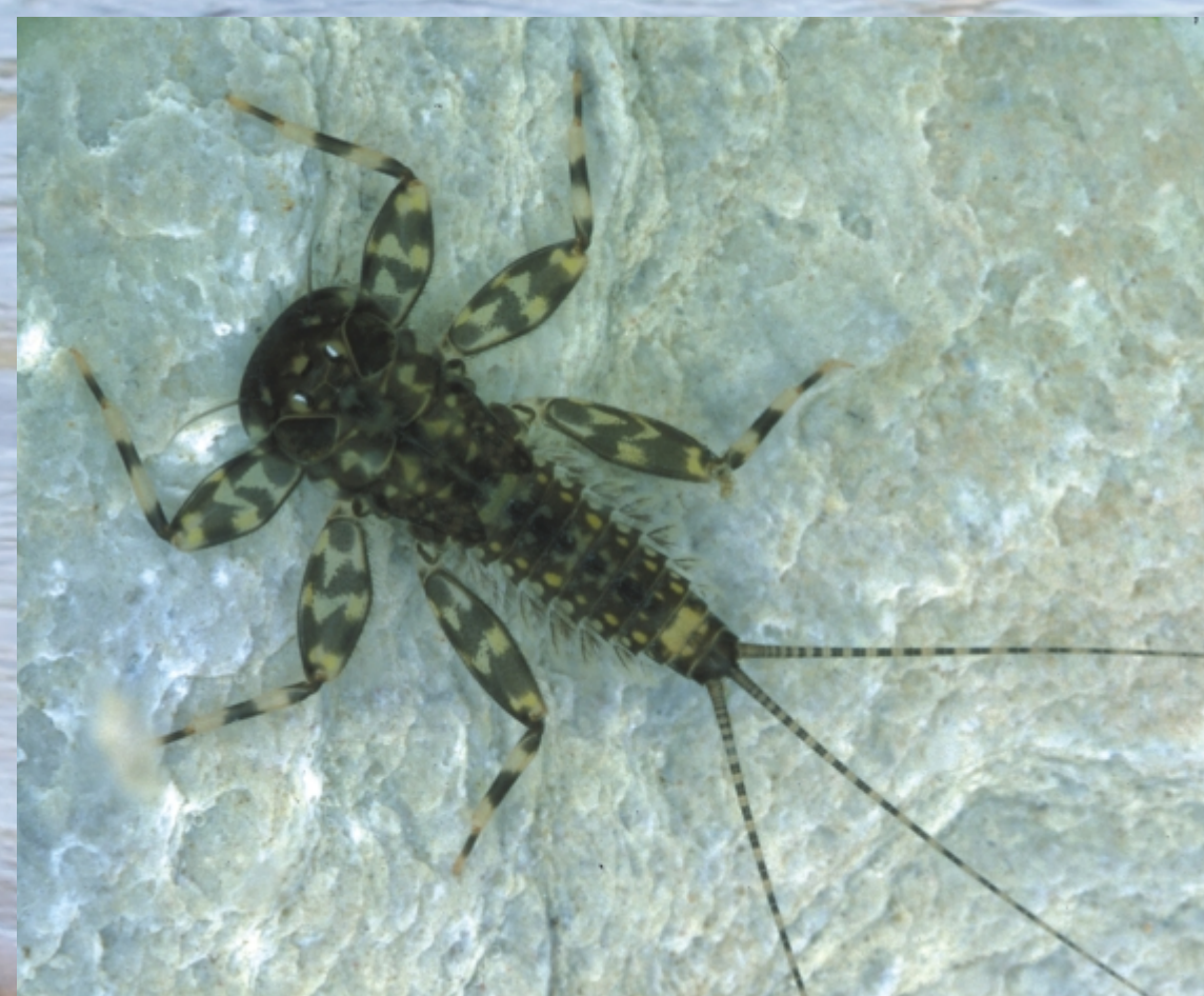
Heptagenia sulphurea (Larve)