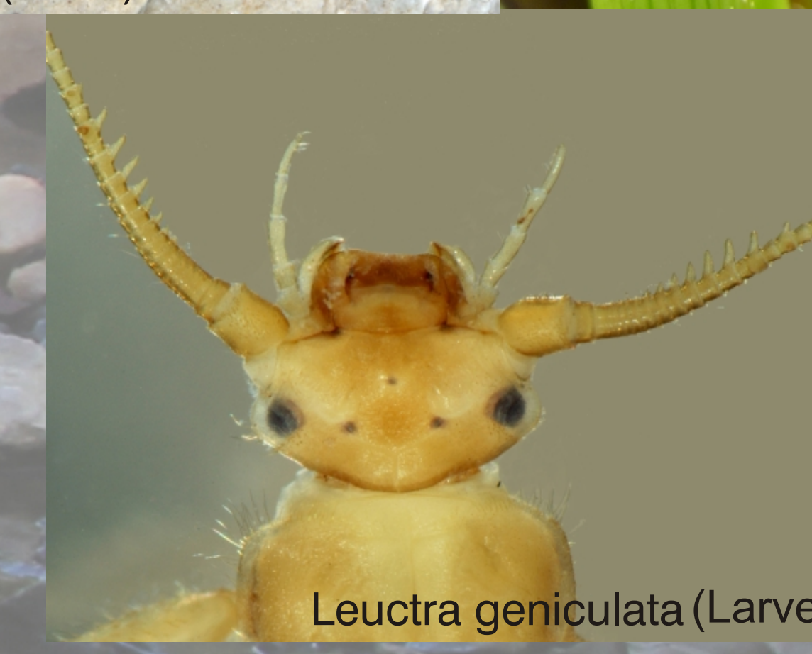
Leuctra geniculata (Larve)