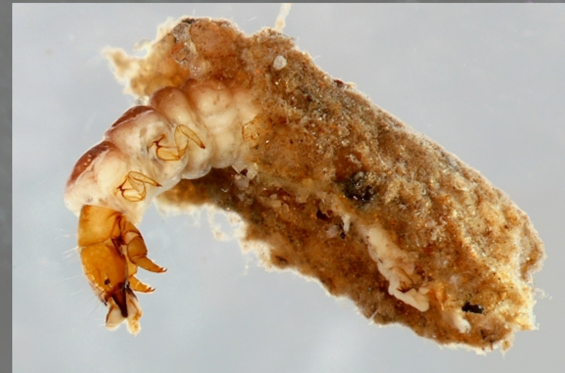
Psychomyia pusilla (Larve)