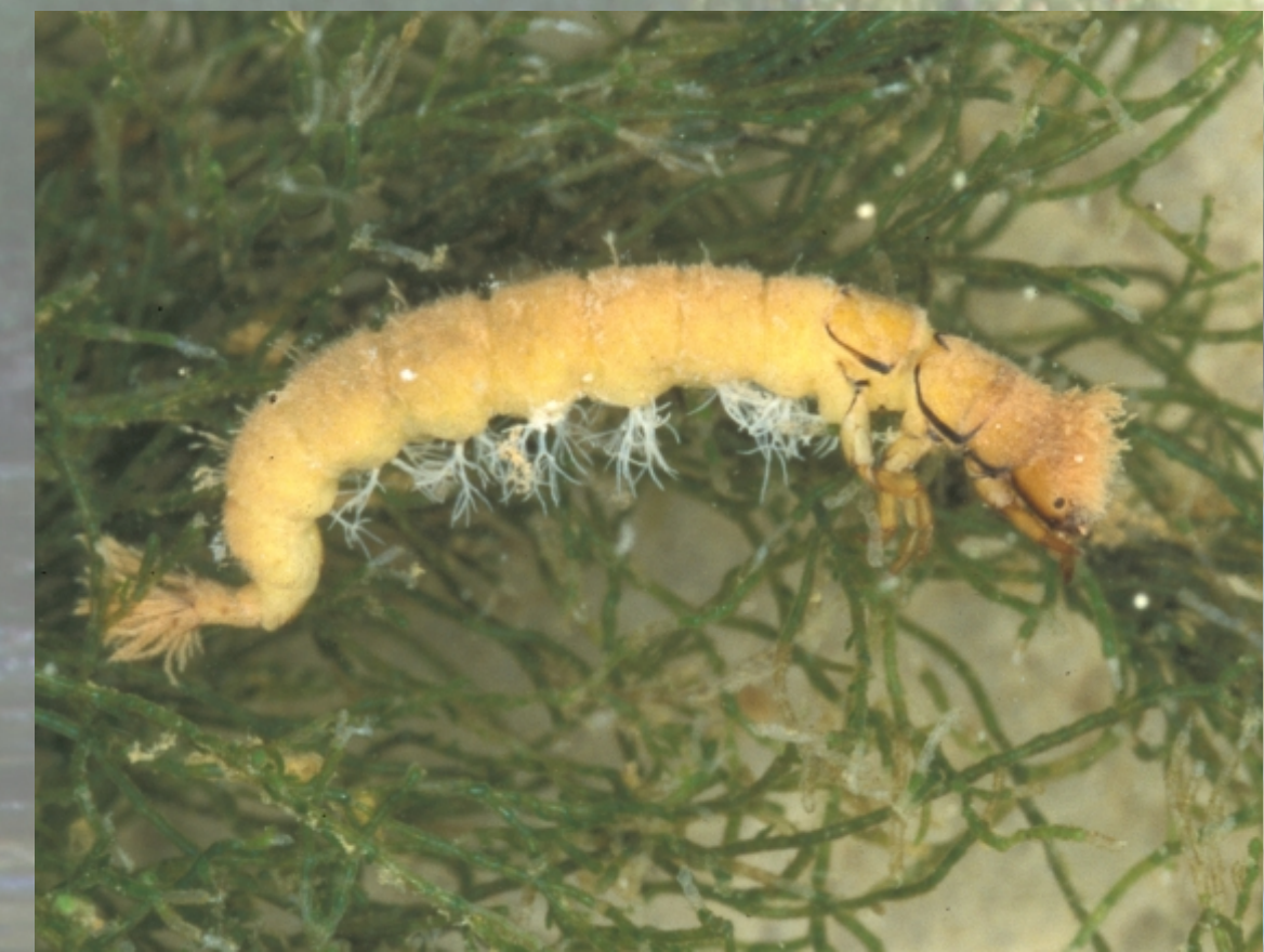
Cheumatopsyche lepida (Larve)