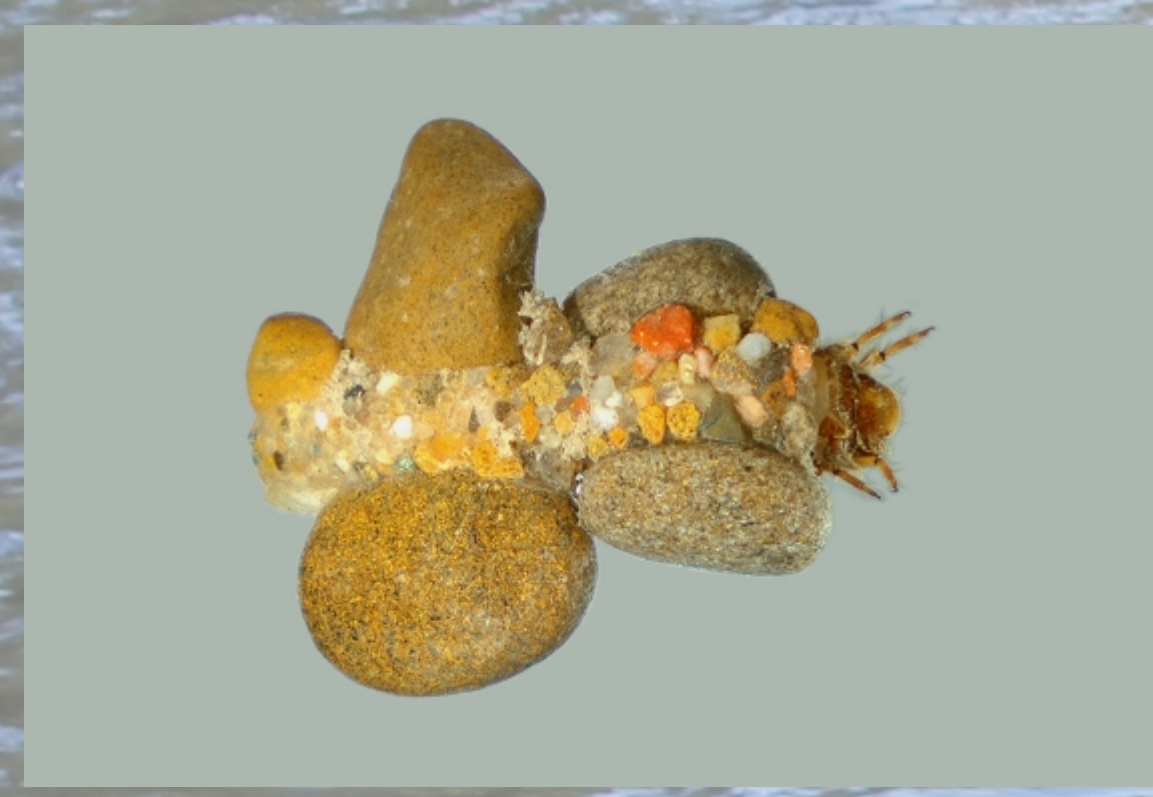
Goera pilosa (Larve)