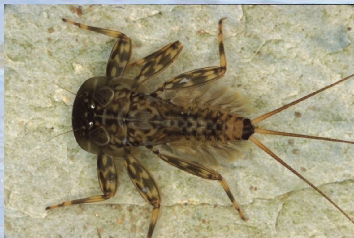
Ecdyonurus torrentis (Larve)