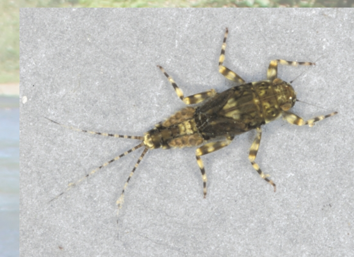
Ephemerella ignita (Larve)