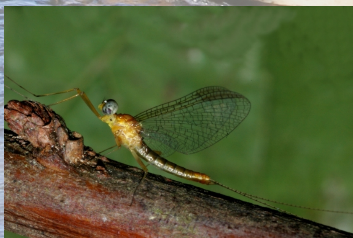
Heptagenia sulphurea (Imago)