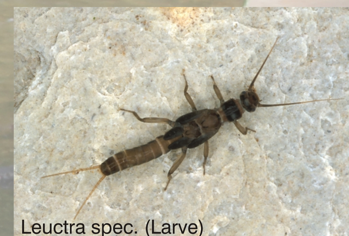
Leuctra spec. (Larve)