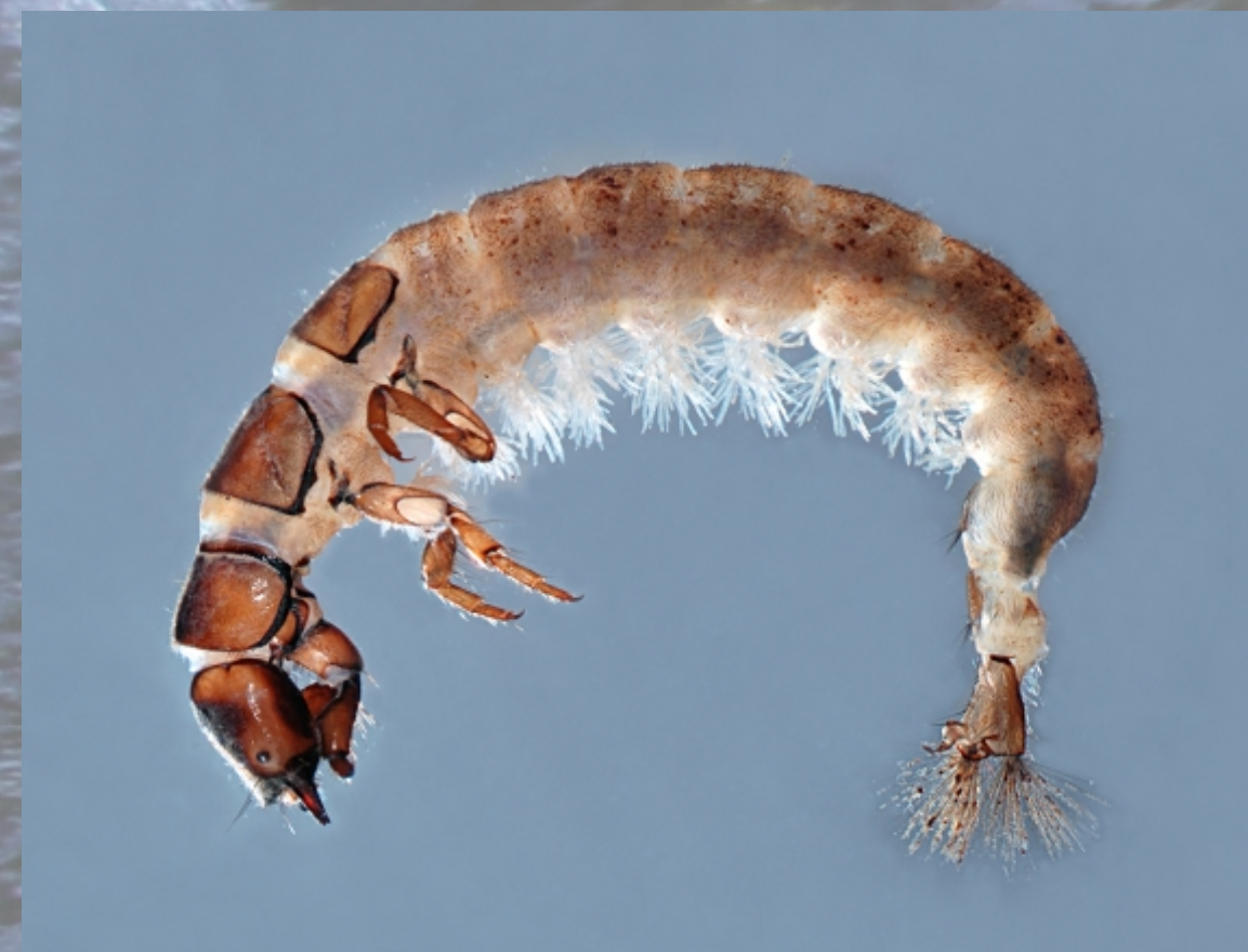
Hydropsyche spec. (Larve)